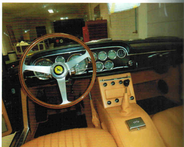
// The new interior of the Ferrari 330 America, s/n 5037GT